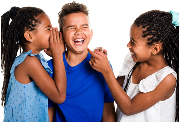
Vocalize or chat with a neighbor