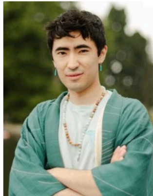
Sage Suzerris Understudy Player 1 and 3